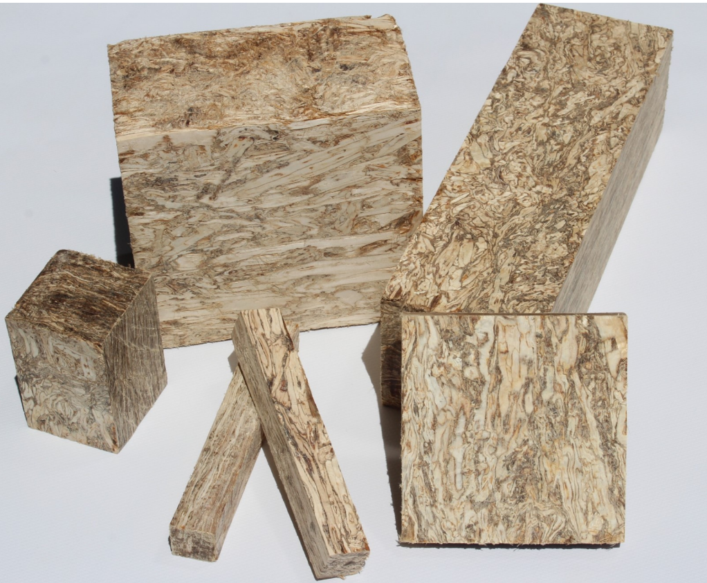
Table & Cabinet Kits

For woodturning tips, refer to our YouTube channel and HempWood® Documents on our website!