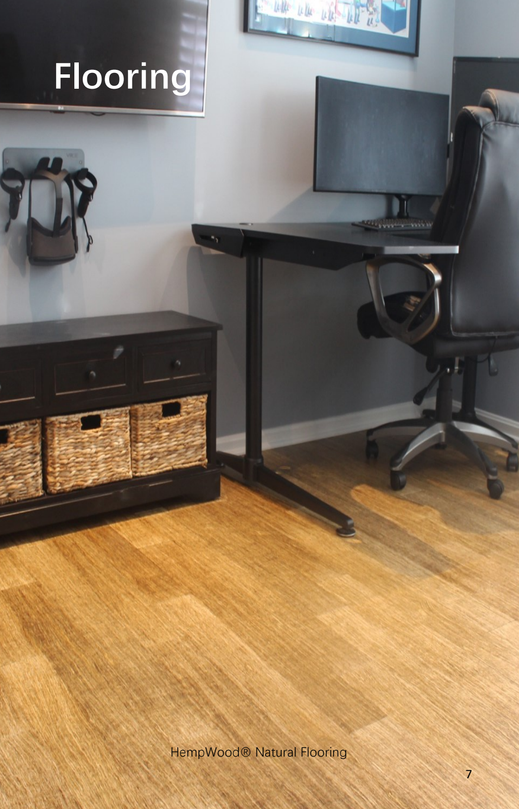
HempWood® Natural Flooring