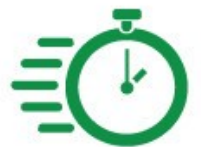
Grows Faster Than Oak