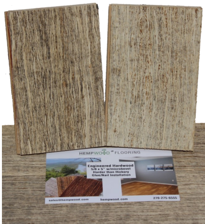
Flooring Sample Pack