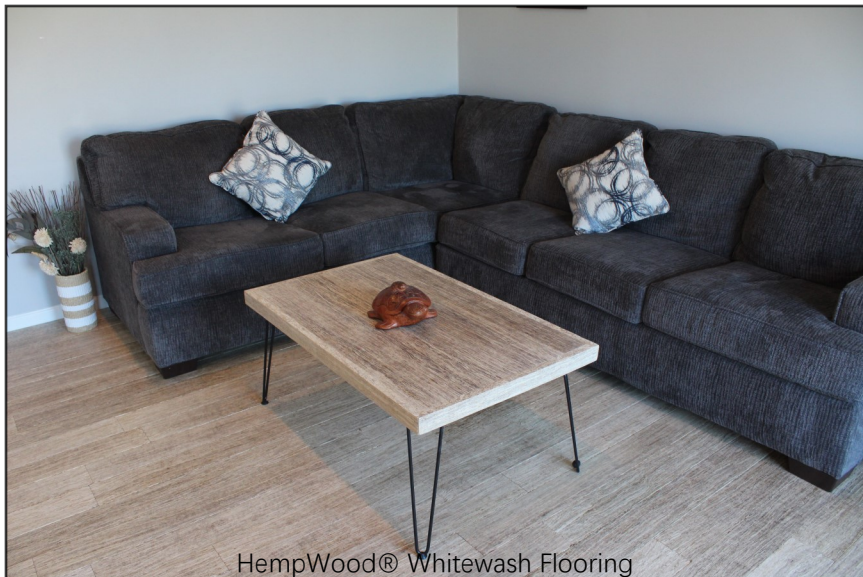
HempWood® Whitewash Flooring

HempWood® flooring offers the perfect environment for a weekend of relaxation or a productive afternoon in the office.