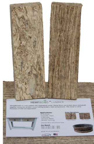
Lumber Sample Pack