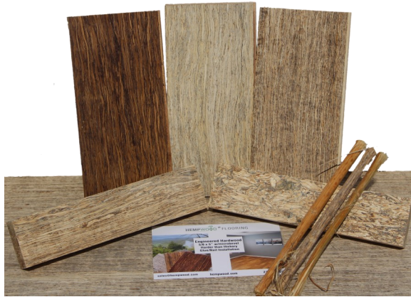
Architecture & Design Pack